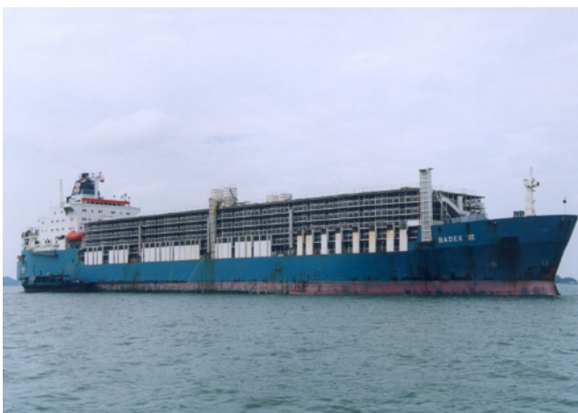
The 28 year old “Bader III”