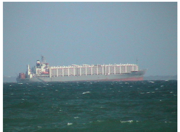
The “Maysora”, built in `1989 Animals piled high.