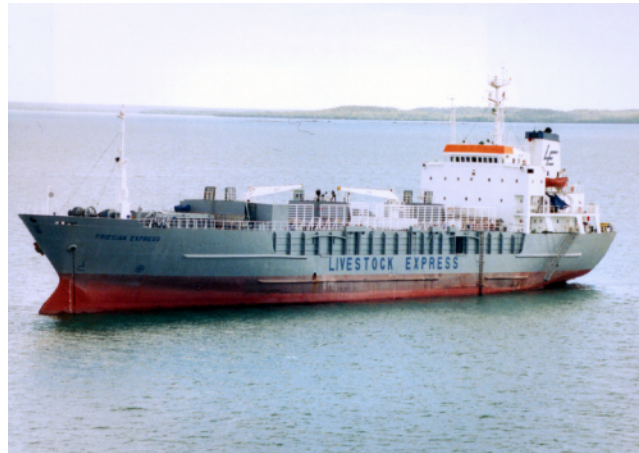
The 24 year old “Friesian Express” Cattle are carried below decks in terrible heat

For further information, please contact Suzanne Cass, 0414 726935.