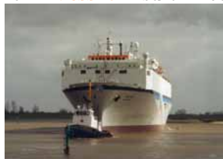
The " Al Messilah " built in 1980

The " Al Messilah " was detained in Portland in February 2002, with deficiencies in certificates of Master and officers. It was also the subject of AQIS and AMSA enquiries into "excessive mortalities in 2002, when 2,173 sheep died. An entry in Hansard revealed that it is a vessel of choice for "deserters" of the human variety, along with the " Danny F II ".