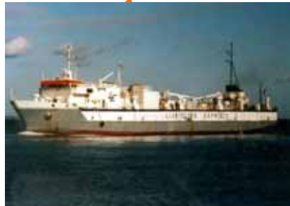
The “ Buffalo Express ” built in 1983

And finally, the pride of the fleet, the “ Becrux ”