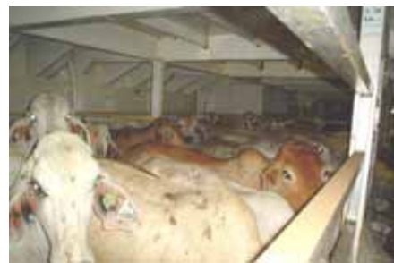
Cattle on the “ Alnilam Prima ” 2003

The “ Kalyrnian Express ”, built in 1964 and showing it